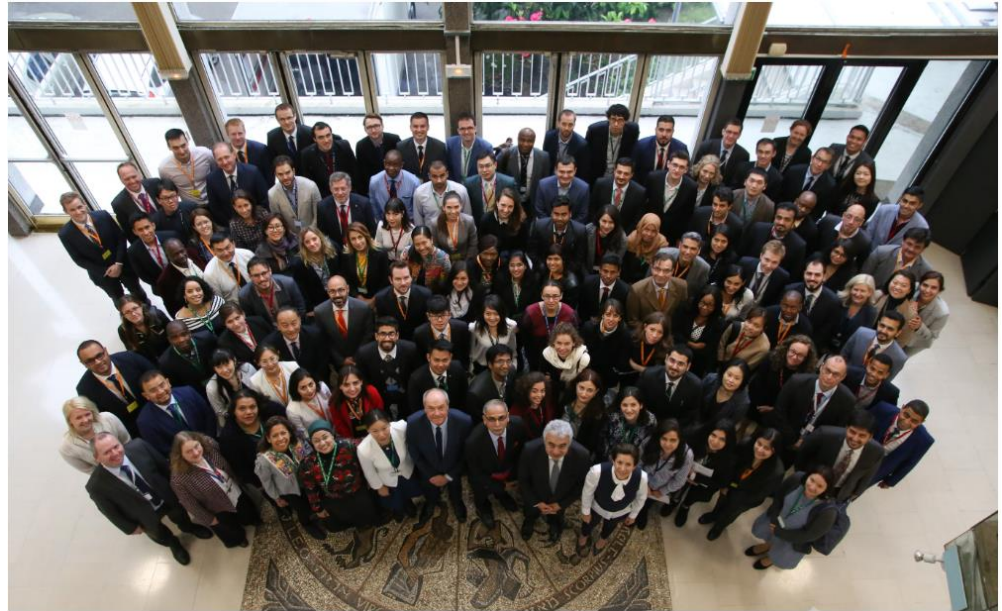
The 2018 Energy Efficiency Training Week held in Paris