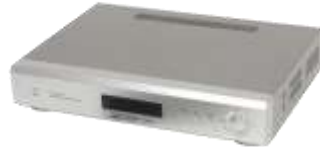
SD STB 150kWh