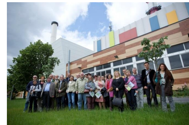
UNECE/FAO Forestry and Timber Section, Geneva, Switzerland