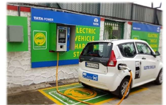
Cost and availability improvements increase the opportunity