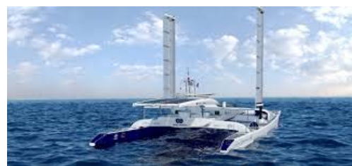
Energy Observer, launched in April 2017, is the first hydrogen vessel in the world