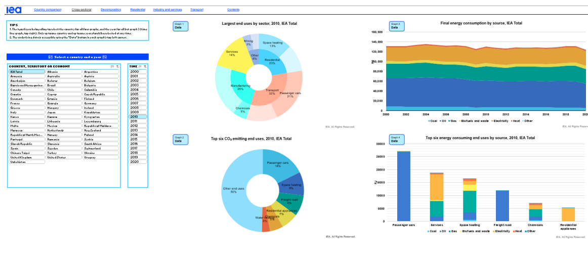
Figure 4 Sample graphs from the Cross-sectoral graphs tab